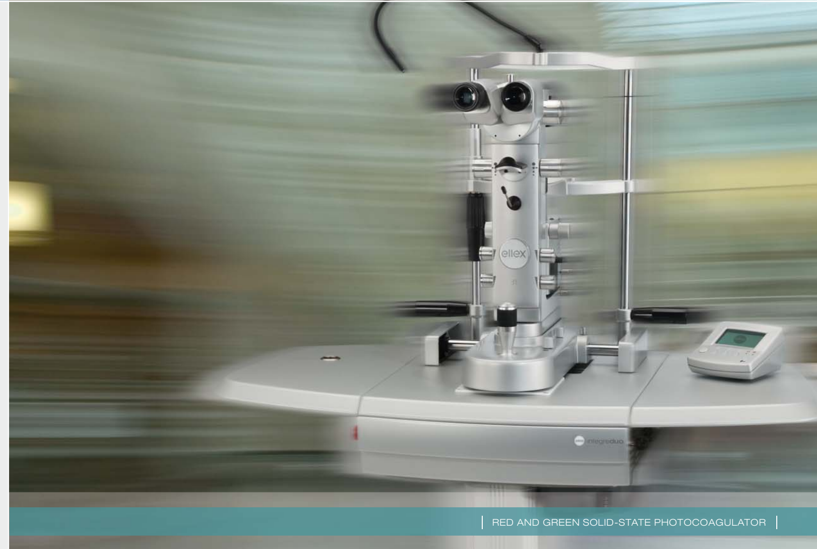
RED AND GREEN SOLID-STATE PHOTOCOAGULATOR